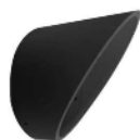
Anti glare visor